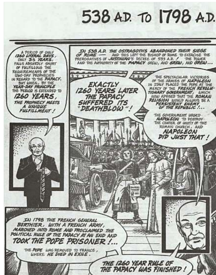
Figure 1 Clever illustration of events from 538 AD

Symbolic of "teacher, lawmaker and judge" and above all other monarchs on earth.